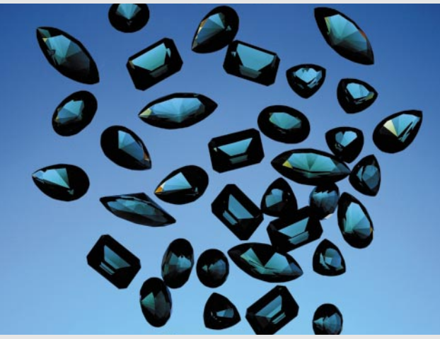
PERSPEX™ FROST Citrus